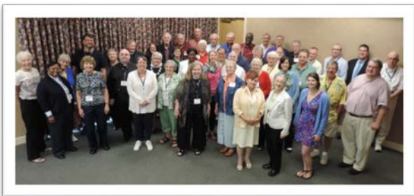
Participants of the NEHA Conference 2015 Louisville, KY

Visit episcopalhistorians.org/membership .